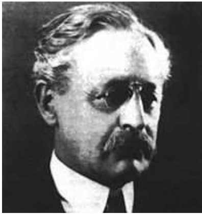
Halford J. Mackinder

decades Russia, based on that area, was in a most advantageous position to expand its power. 4